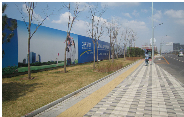
Barriers are one way to block traffic noise from adjoining communities.