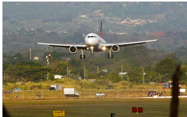
Environmental noise has been associated with anything from annoyance and sleep disturbance to increased risk of cardiovascular disease and impacting children’s ability to learn in school.

Example: Szalma and Hancock’s (2011) meta-analysis included 797 effect sizes derived from 242 studies. Effect sizes measure the strength of a phenomenon, such as how much intermittent noise can impact stress or performance versus continuous noises. They found that the evidence supported the “contention that change in the pattern of noise [intermittent noise] constitutes a crucial variable that moderates the relationship between noise and performance. Indeed, recent evidence indicates that unpredictable change in environmental input (including the task itself) may be one of the most significant sources of stress” (Szalma and Hancock 2011, 700). In other words, intermittent noises are more distracting, annoying, and stressful than other factors, such as volume of the noise.