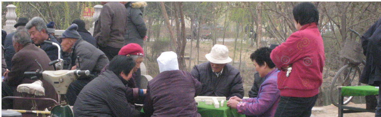
Chinese people with high levels of bonding social capital (trust) report higher levels of health.

Example: In 2004, Yip et al. (2007) surveyed 839 households (n=2401 people aged 16-80) in rural China to examine the relationship between social capital and health. Social capital was defined as structural (e.g. bridging) versus cognitive social capital (e.g. bonding) and health metrics included self-reported health, psychological health, and subjective well-being. The authors found, “Results indicate that cognitive social capital (i.e., trust) is positively associated with all three outcome measures at the individual level and psychological health/subjective well-being at the village level as well. We further find that trust affects health and well-being through pathways of social network and support. In contrast, there is little statistical association or consistent pattern between structural social capital (organizational membership) and the outcome variables. Furthermore, although organizational membership is highly correlated with collective action, neither is associated with health or well-being” (Yip et al. 2007, 35).