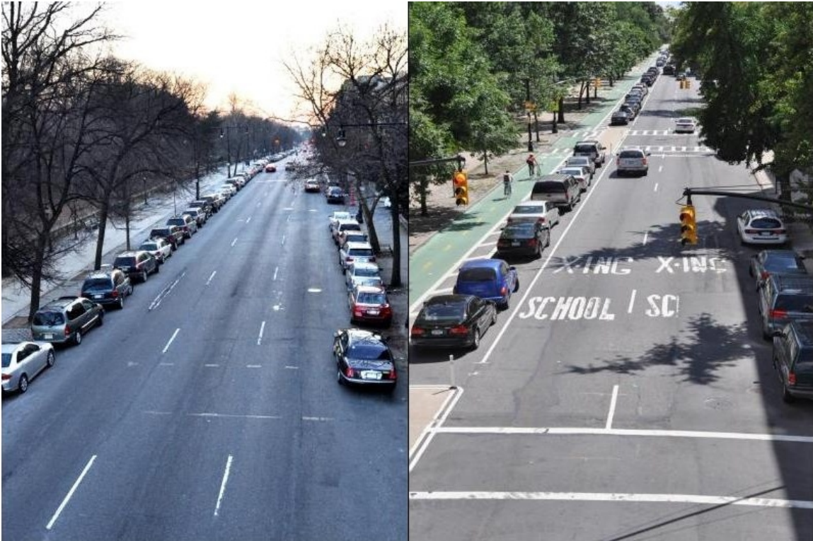
Figure 5: Prospect Park West Before and After Changes

Despite these controversies, a respected polling organization reported shortly after the article appeared that New Yorkers favored bike lanes by a 54/39 margin. 68 Bloomberg and key aides then moved publicly to defend Sadik-Khan. In a two-page memo written on “Office of the Mayor” letterhead and posted on the mayor’s website, Howard Wolfson, a longtime Democratic political strategist then working as Bloomberg’s Deputy Mayor for Government Affairs and Communications, cited the poll figures and noted that many bike lanes were built at the request of local Community Boards. Wolfson, who also defended the program in interviews and media appearances, pointed out that while the city had added 255 miles of bike lanes in the previous four years, it still had over 6,000 miles of streets. Moreover, he concluded, the city’s experience with the new bike lanes was that they usually produced at least a 40 percent drop in fatalities and serious injuries to drivers, pedestrians, and cyclists. 69