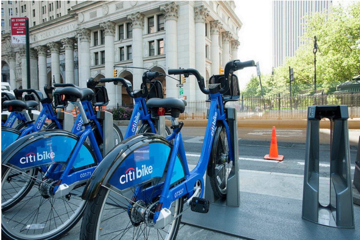
Figure 6: Citi Bike Station

about five times a day, far more than in any other US city with a bike-sharing program, and comparable to Paris, which, like New York, has an unusually dense network of bike stations. 75 In addition, an August 2013 poll found 73 percent support for the bike sharing system and 64 percent support for the new bike lanes on city streets. 76 Moreover, the courts rejected several suits challenging the location of bike stations, including one filed by the owners of the famed Plaza Hotel.