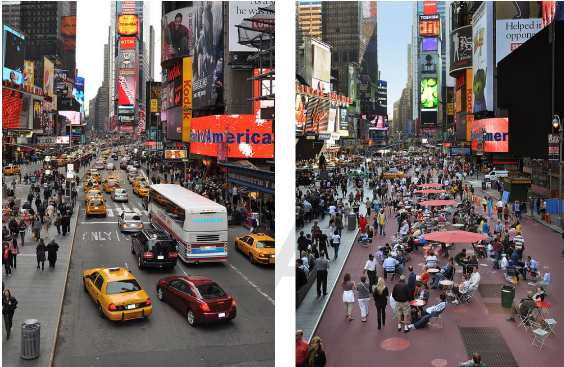
Figure 3: Times Square Before and After Changes

The new facilities immediately became great attractions, and in a July 2009 poll New York City residents supported them by a 58/34 margin. Surveys done a few months later by the Times Square Alliance also found that more than two-thirds of the area's major property owners, employers, tenants, users, and theatergoers strongly supported the changes. 46 However, not everyone was a fan. In August David Letterman, whose show was taped in Times Square, joked that the city had turned “the greatest street in