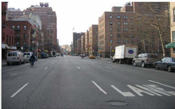
Figure 1: 9th Avenue Before and After Changes

DOT carried out another important early project in the Meatpacking District, which had been the focus of workshops that had been part of the campaign launched by TA and the Project for Public Spaces. Picking up on key ideas developed in that process, in June 2007 the department proposed to quickly create a public plaza at the intersection of 9 th Avenue, 14 th Street, and Hudson Street. The department’s plan also took advantage of a scheduled repaving of 9 th Avenue to extend sidewalks at intersections, shorten pedestrian crossing distances, and convert one traffic lane into a bicycle lane. (See Figure 1)