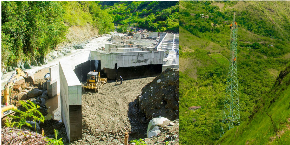
Fig 01: 8 de Agosto hydroelectric plant and 138 kV transmission line